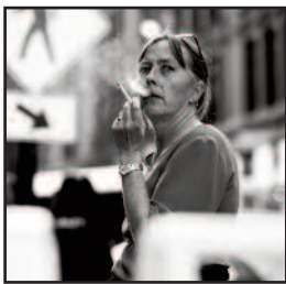
Eye of the Beholder 'Best in Show'