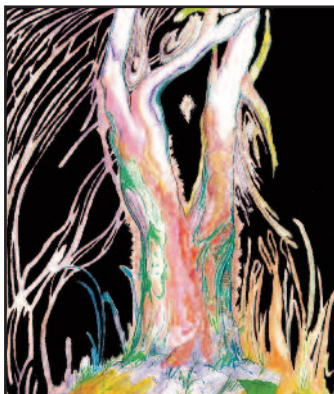
Wild with Color 'People's Choice' "Whiteness of a Different Color" mixed media by Julia Dugas