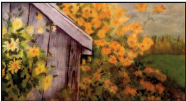
"Flowers at Lamson Farm" watercolor by Gwen Morgan