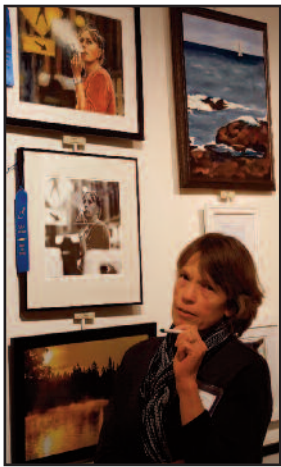
When your partner in a show doesn't show at the reception....