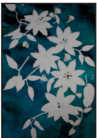
"Clematis #1" by Annick Bouvron-Gromek