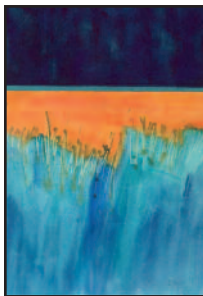
"Tourquois" by Ethel Hills