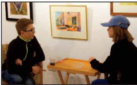
Serious discussions at the gallery