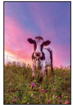
"Vermont Sunset"

www.tonybaldasaro.com email: tbaldasaro@gmail.com or call 603-793-1836.