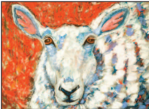
Wild with Color 'Best of Show' "Sweet Sheep", mixed media by Natalie Rotman Cote