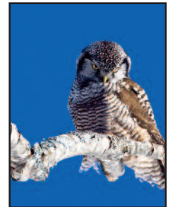
"Northern Hawk Owl"

http://www.liteworksphoto.com email: denniskillman@liteworksphoto.com