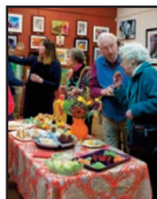
Theme Show Reception