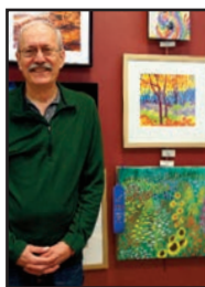
Eric Ebbeson "Wild with Color" Best of Show winner "Wildflowers on a Morning Bike Ride"