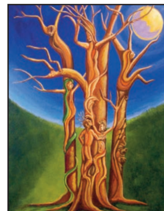
"The Life of Trees"