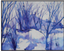
"Hung Up to Dry" May 5 Reception at Epping Library was great! Thank you to all who attended—runs through mid July.