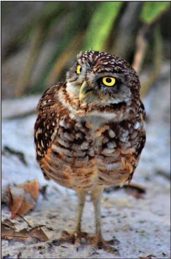
"Pretty Owl"