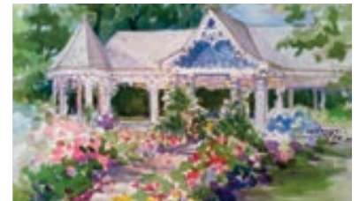
"The Victoria Inn", watercolor by Doris Rice

The Victoria Inn Bed & Breakfast is located at 430 High Street, Hampton, NH 603-929-1437 info@thevictoriainn.com See www.thevictoriainn.com for directions so you don't drive by this lovely inn at night.