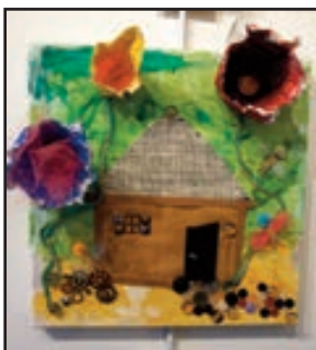
Siblings Myles and Addie solve the Mystery together!