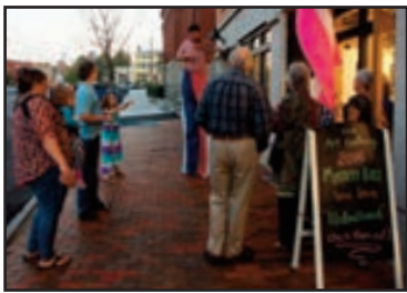
Life is full of Mysteries