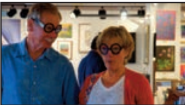
Out of this World Show Alien invasion during Out of this World reception