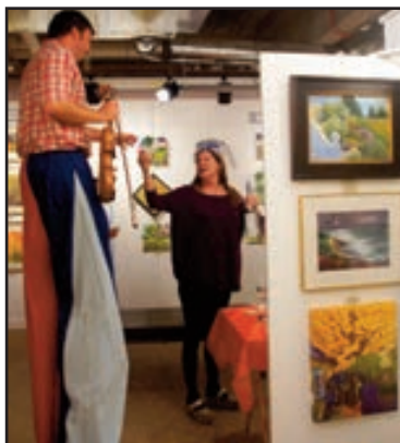
Where was this guy during renovations???