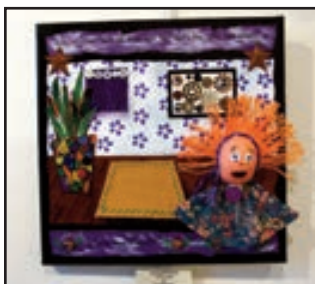
Mystery Kit People's Choice by Susan Bascom