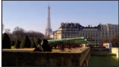
"Paris Cannon Eiffel Tower"