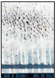
"Birch Trees" photograph by Renee Giffroy