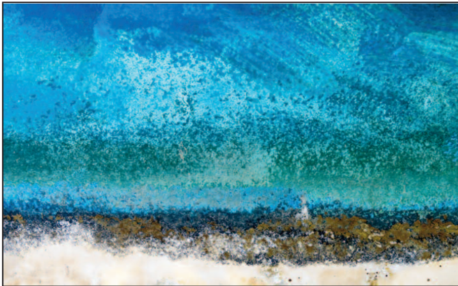
"White Island Light", photograph by Renee Giffroy