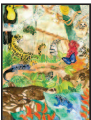
"Colors of Costa Rica" watercolor by Natasha Stoppel - People's Choice in "All the Colors of the Rainbow"