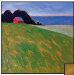
Landscape, acrylic painting by Revelle Taillon

Lisa McManus Exhibit "Homologous Symmetry" A mouthful to describe the recent oil paintings by Lisa McManus, which use geometric symmetry to explore the different functions but similar shapes and structures found in plants and animals. Inspired by years of painting the natural world, and then seeing exhibitions of Oceanic art and MC Escher, the paintings are abstract in nature but contain overlapping bits of fish, bones, trees, and flowers. On view at the Robert Lincoln Levy Gallery, State St, Portsmouth, April 4-29, opening reception Friday, April 6, 5-8pm.