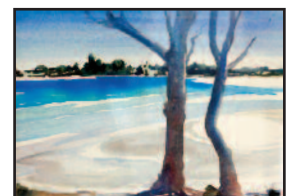
"Thin Ice" watercolor by Veronica Wolfe - People's Choice in 'Winter Blues'

SAA NEWSLETTER: Submit stories & announcements to denise@adceteragraphics.com by the 15th of the month prior to publication.