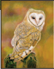
Barn Owl, colored pencil by Revelle Taillon