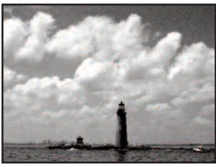
"The Graves, Boston Harbor"