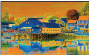
"Waterfront" Best of Show 'All the Colors of the Rainbow'"