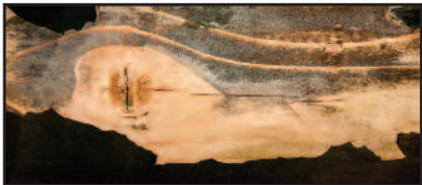
"Western Sky" photograph by Renee Giffroy