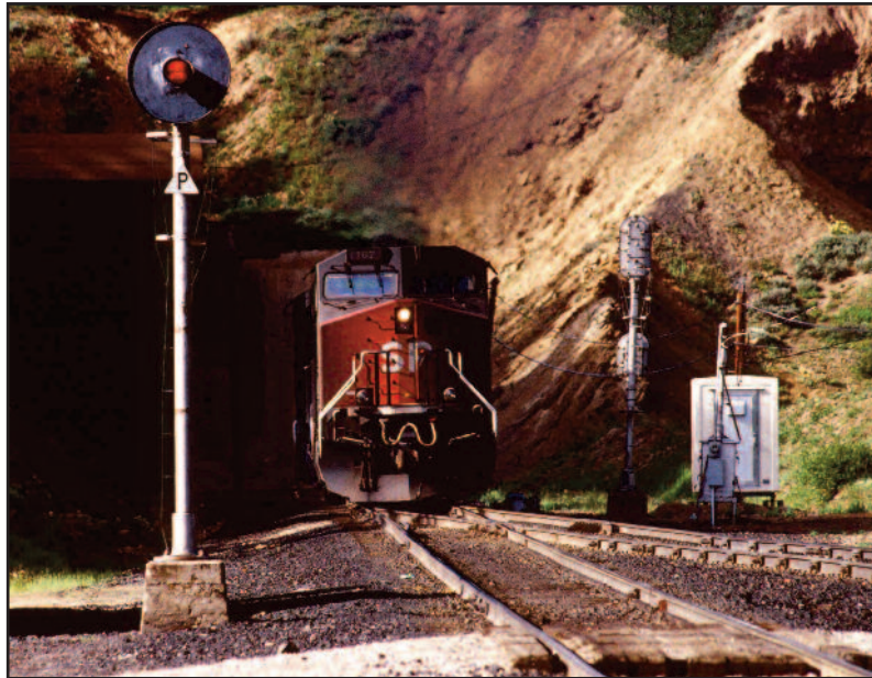
"Tennessee Pass Tunnel"