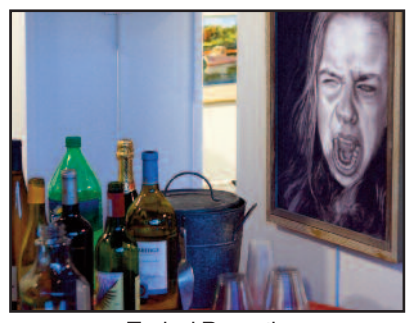
a Typical Recpetion