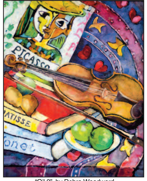
"Oil 2", by Debra Woodward