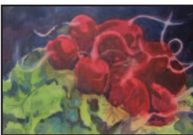
Doris Rice Saturated Watercolor