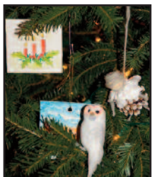
A branch from the SAA tree