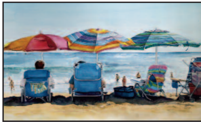
"Sunlight on the Seacoast", watercolor by Kimberly Cooper