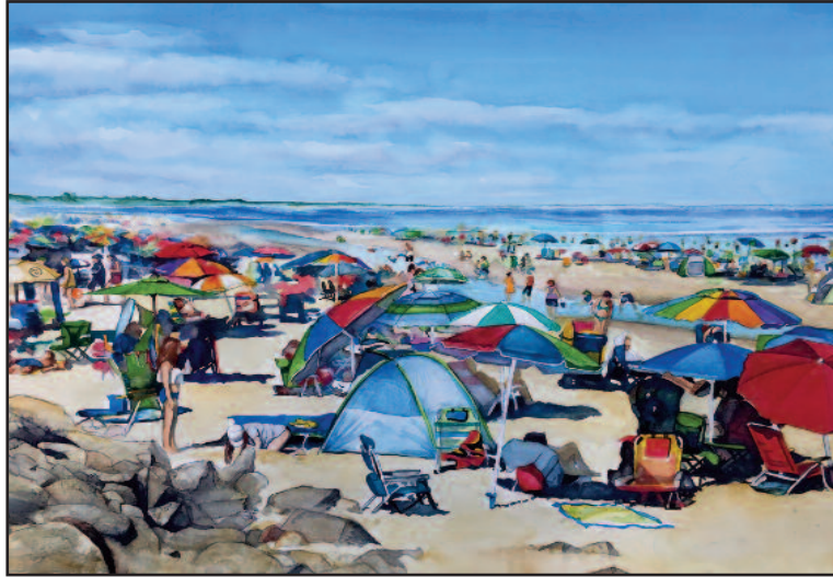
"Sunlight on the Seacoast", watercolor by Kimberly Cooper