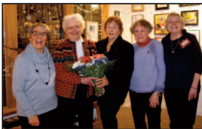
A long, strong, gallery member foundation of women