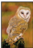
"Owl" by Revelle Tallon