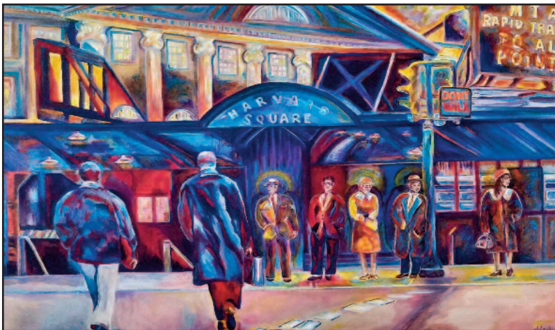
Soul Reapers at Old Harvard Square – Angel/Demon Series, acrylic by Janice Leahy