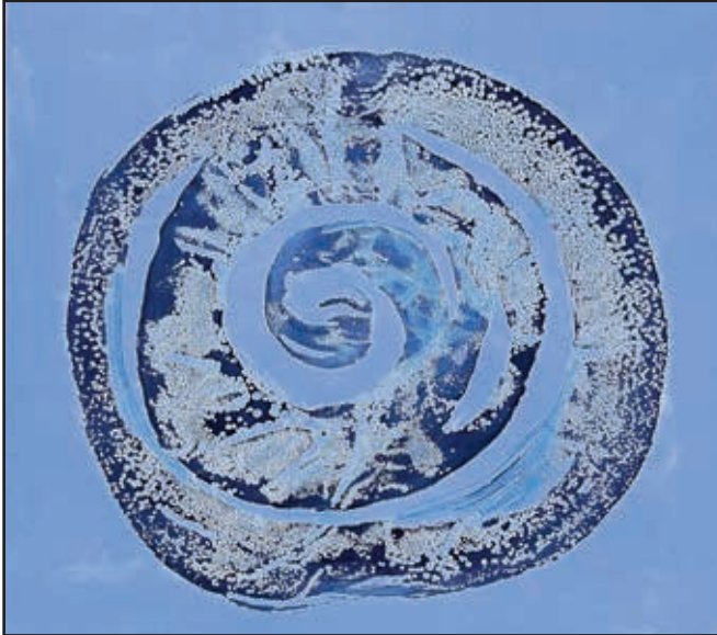
"Traces 3", encaustic on wood by Wo Schiffman