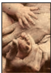
Up Close and Personal People's Choice - "Hands Touching Hands, Touching Toes, Touching Souls" photo on handmade paper by Mary Jane Solomon