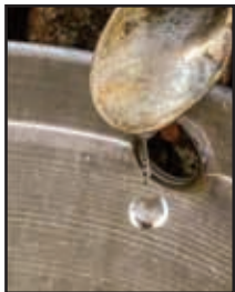
Up Close and Personal Best of Show - "Soon to be Syrup" photograph by Cindy Knight