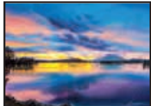
Eye of the Beholder People's Choice pair - "Five Lakes Sunset" photograph by Dennis Skillman and "Sunset at Five Lakes" oil by Kimberly Cooper