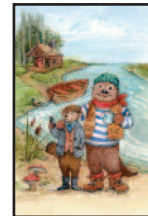
"Cheeky and C" cover