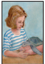
"Every Turtle Counts" cover