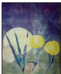
"Moon Garden," Ink Monotype by Annick Bouvron-Gromek