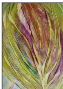
"Hostas," Encaustic Monotype by Wo Schiffman