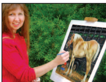
"Horse Power" by Denise Brown