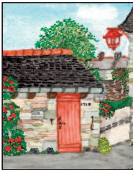
"Saint Suliac", watercolor by Beveridge