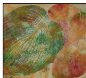
"Hostas," Ink Monotype by Annick Bouvron-Gromek