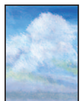
Acrylic by Revelle Taillon

runs 8 weeks, 10:30 am~12:30 pm. This class is for anyone who has had a class in acrylics or has learned the basics on their own. Learn new information, and explore more tips and tricks in acrylic painting. Acrylic paints offer a wide variety of ways to apply paint and you will learn about different kinds of mediums to extend your drying time, extend your supply of paint, or add texture. Fee is $160.00.