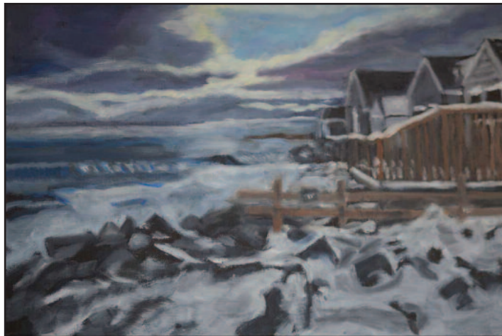
Little Boar's Head After Storm", oil, Debra Woodward