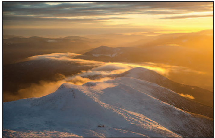
"Mountain Sunrise" photograph, Kevin Talbot