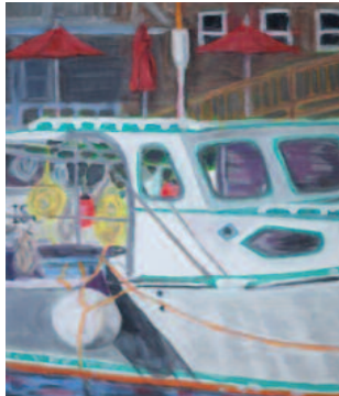
"Perkins Cove Boat" oil, Debra Woodward