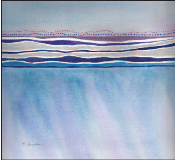
"Horizon X," watercolor, Barbara London