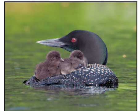
"Loon Family," photograph by Kevin Talbot