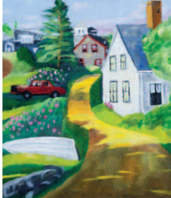
"Main Street, Mohegan Island," oil, Debra Woodward