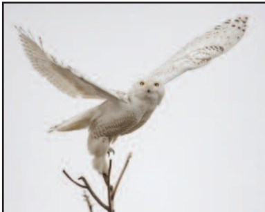
"White Owl,"