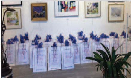
Mystery Kits display