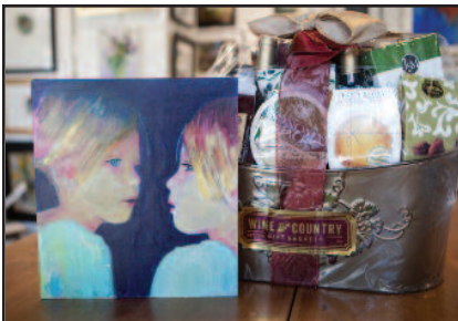
"I Hope You Dance" acrylic by Zoe Brooke with Mother's Day raffle gift basket