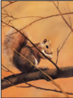
"Precious Squirrel" Oil by Ellen Whitman