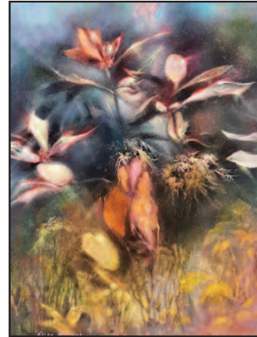
"Alpine Bush In Morning Light" Oil by Ellen Whitman