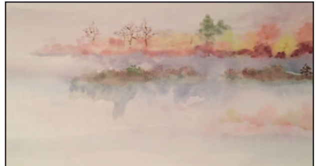
"Autumn Fog" watercolor by Cheryl Sager