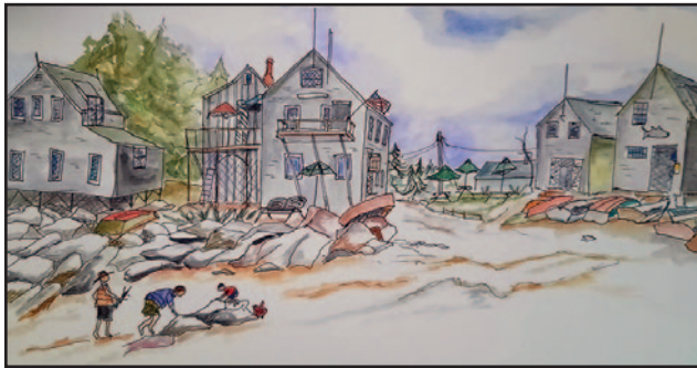
"Day at Fish Beach" watercolor by Carol Poitras