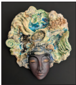
July Best of show Ceramic Sculpture "Sweet Dreams" by Natasha Dikareva