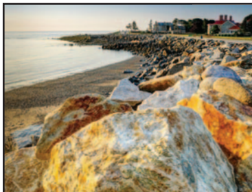
August best of show "Fortified"