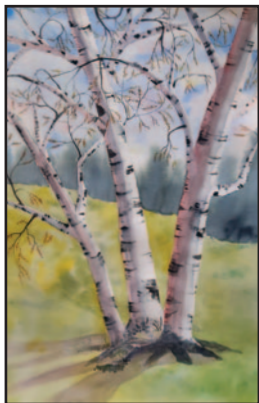
"Signs of Spring" watercolor by Cheryl Sager