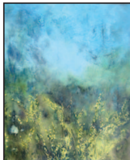
"Spring Awakening" acrylic & inks by Noel Soucy