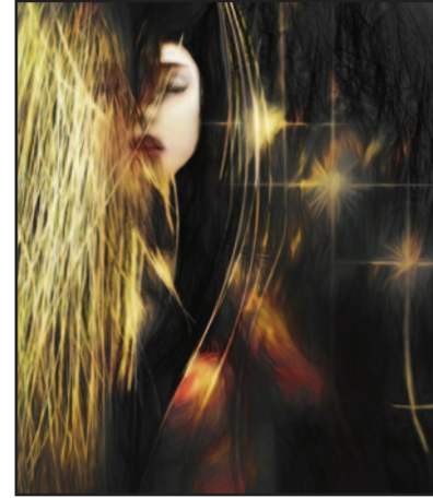
"Trinity" digital photo art by David Blomquist