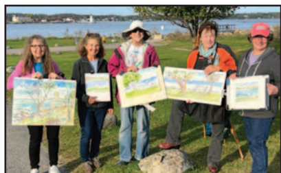
SAA Plein Air Artists Group who met at New Castle Commons in October