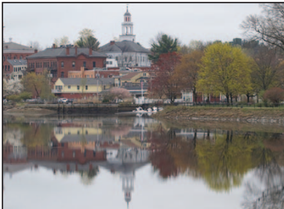
"Town of Exeter"