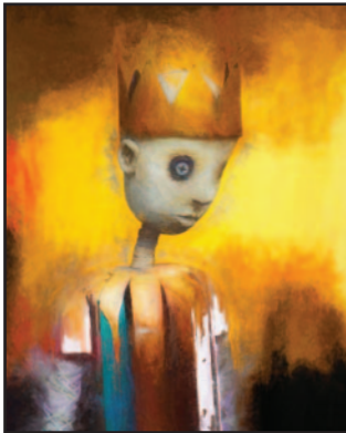
"Boy King" digital photo art by David Blomquist