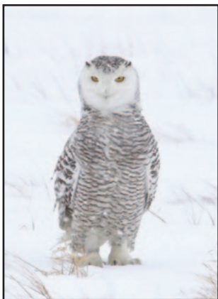
"Snowy Owl"