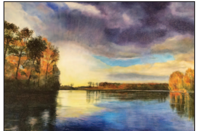
"Autumn River" acrylic by Jane Copp