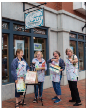
SAA Scholarship Committee promoting the Y'Art Sale