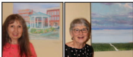
A few of the artists exhibiting at the Exeter Inn Fall Art Exhibit