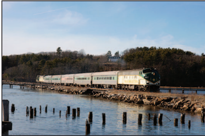
"Maine Coast Wiscasset," photography by Dave Saums

SAA Gallery Body of Work Artists: September 2022