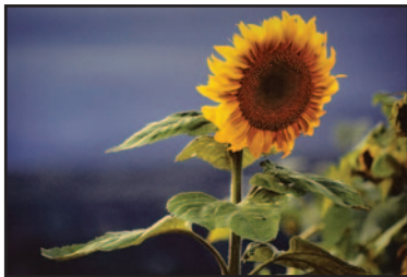
July Best in Show Winner "Sunflower, Approaching Thunderstorm" photography by Dave Saums