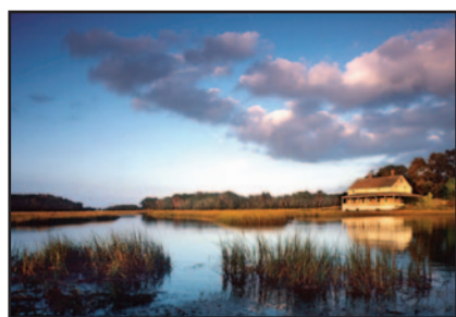
"Essex Motif," Photography by Dave Saums