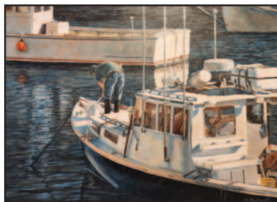
July People's Choice, "End of the Day," oil by Adele Buchwald