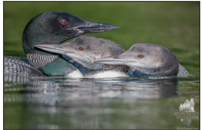
"Hungry Teens," photography by Kevin Talbot