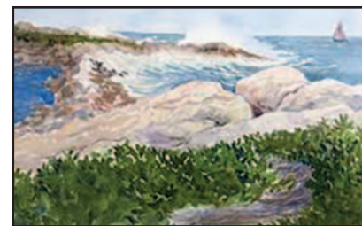
watercolor by Doris Rice

Check out the Star Island website for Doris's September 5-9 workshop there. And it is never too early to sign up for Doris' Holiday Greeting Card Workshop in Portsmouth 11/12. It always fills up early! See dorisrice.com for details and to register. You can also email her at dorisrice@comcast.net