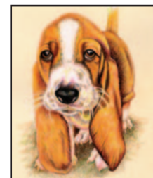
Drawing! by Revelle Taillon

A percentage of each tuition is donated to the SAA.