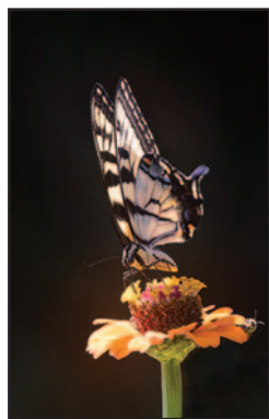
"Tiger Swallowtail Butterfly," Photography by Dennis Skillman