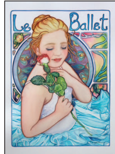
"Le Ballet," watercolor by Kimberly Cooper

SAA Gallery Body of Work Artists: October 2022