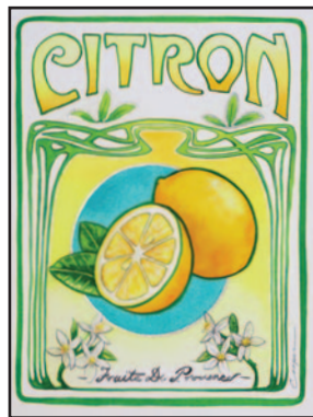
"Citron," watercolor by Kimberly Cooper