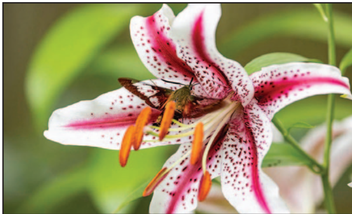
"Hummingbird Moth,"