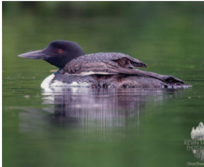
Kevin Talbot Peekaboo Photograph on Metal I spent hours sitting in my kayak watching loons raising the two chicks on the tiny pond, capturing their devout parenthood.