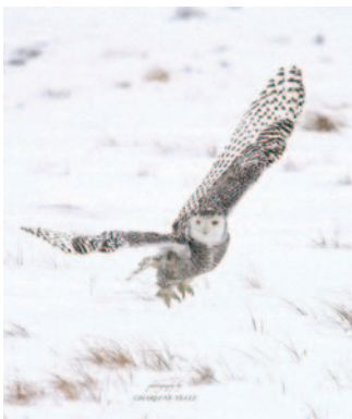
Charlene Yelle Snowy Owl in Flight Photograph The three hours alone with this magnificent Snowy Owl felt like we were together in a snow globe as the snow began to fall.