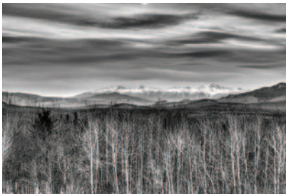
Dennis Skillman Moon Over Presidential Range Photograph This was taken from the top of Sugar Hill, NH. Black and white emphasizes the cold chill of a mid-winter dusk.