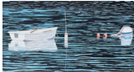
Dave Turbide Quiet Mooring Acrylic They are a quintet, singing a song of the sea, or perhaps a lead singer backed by a small combo and large chorus.