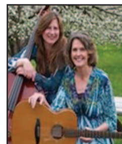
Nice & Naughty