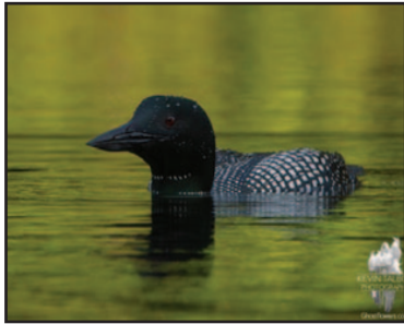
"Loon,"

Photographs of the New England hikes he took with his wife and dogs and his Mt. Washington photos can be found at: Ghostflowers.com