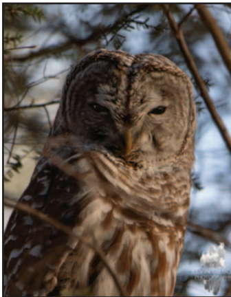
"Barred Owl,"