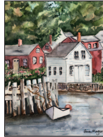
"Vinalhaven," watercolor by Gwen Morgan

SAA Gallery Body of Work Artists: December 2023