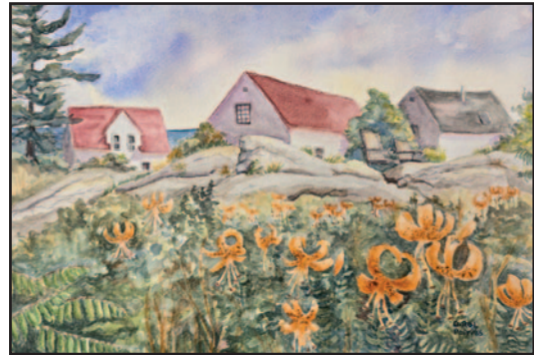
"Tiger Lilies, Star Island" Watercolor by Carol Poitras

SAA Gallery Body of Work Artists: June 2024