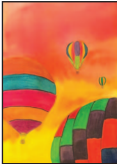
“Hot Air Balloons,” Watercolor by Cheryl Sager