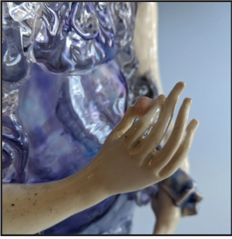
"Pearl of Wisdom," sculpture by Natasha Dikareva