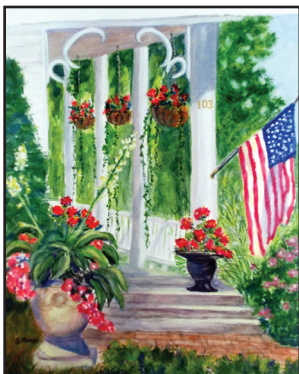
"Welcome to 103 Front Street," Oil by Suzanne Manzi