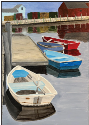
"Rockport Harbor," Acrylic by Dave Turbide