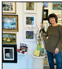
April BOW "New Beginnings," fabric art by Christine Blomquist