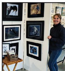
April BOW "Animals of Swasey Park,"