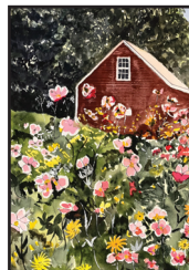
"Sarah's Garden" watercolor by Dannielle Genovese