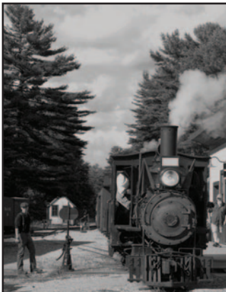
“Sheepscot Steam!”