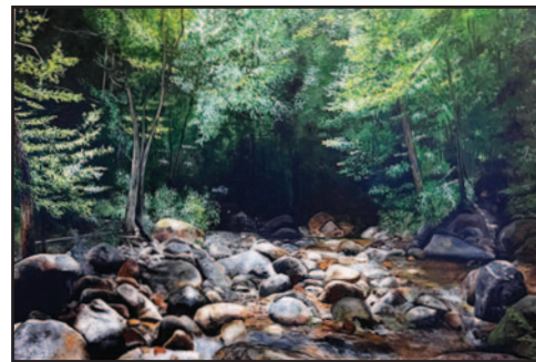
“Whose Woods These Are,” Acrylic by Jane Copp