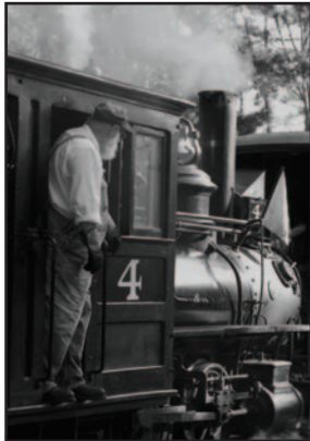
"Steam Engineer and Smoke, Maine,"

I seek to foster a greater appreciation for the environment, inspiring others to protect the beauty that enriches our lives. My journey as a photographer is one of discovery, capturing fleeting moments that celebrate the incredible tapestry of life on our planet.