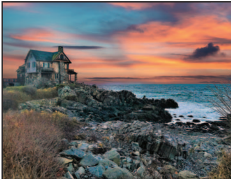
“House on the Shore,” Photograph by Ray Alercon

SAA Gallery Body of Work Artists: December 2024