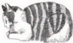
Drawing by Revelle Taillon