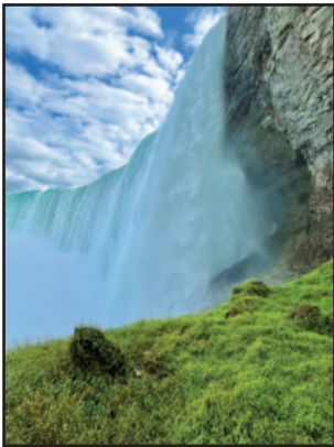
"Below the Falls,"