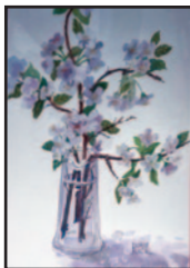
"Spring Blossoms" watercolor by Doris Rice