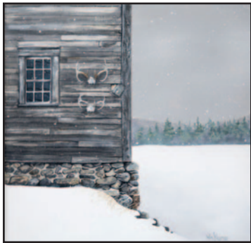
“Silent Memories,” Acrylic by William Kramer

I give a great deal of thought to composition, and strive to make each painting an intriguing blend of shape and value. I take time with drawing, then create an underpainting in a warm tone that serves as my road map for values. I mix my colors on my palette before applying to the surface, then focus on the application of paint with interesting brushmarks. Finally, I pay attention to edges, which can elevate a pretty good painting into something really special.