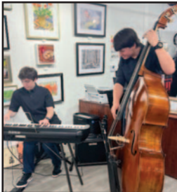
The Real Deal