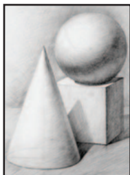
Pencil Drawing by Revelle Taillon