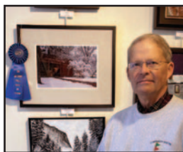
January Best in Show "Kensington Social Library" digital image by Dave Saums