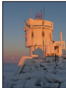
January People's Choice "Sunrise/Moonset at Mount Washington"