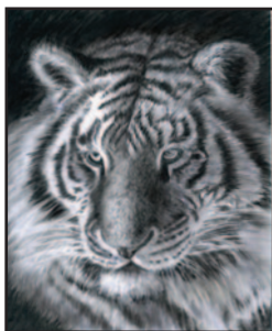
"Tiger" Charcoal Drawing by Revella Taillon