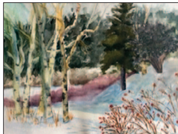
Ice Pond Road