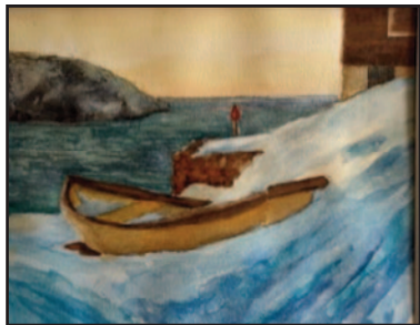
"Fish Beach," Watercolor by Sue Hitchcox