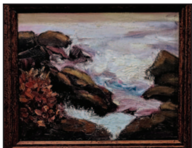
"Seascape," Acrylic by Sandy Serino