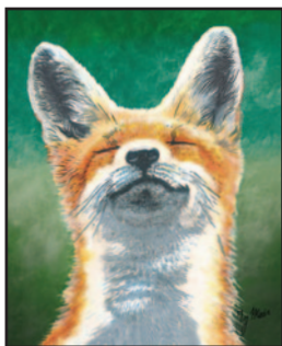
"Happy Fox," Pen & ink / Acrylic by Ty Meier