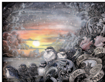
This Too Shall Pass