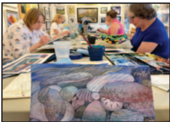
Doris Rice watercolor class