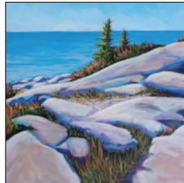
Great Head Trail Acadia