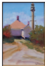
Best in Show Jeanne Pierce "Sanibel Island Light"