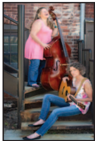
Nice and Naughty July 2nd Friday Music