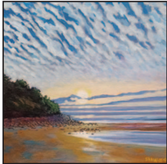
"Plum Island Sunrise" by Shawne Randlett