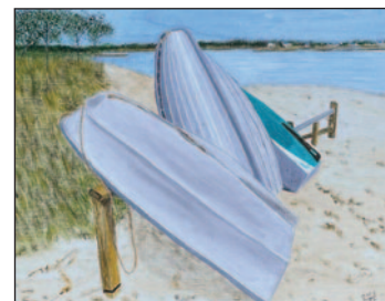
Bass River Row Boats