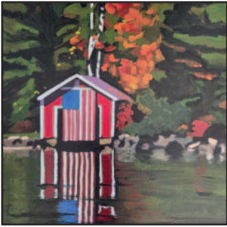
"Star-Spangled Water" by Cheryl Shanahan